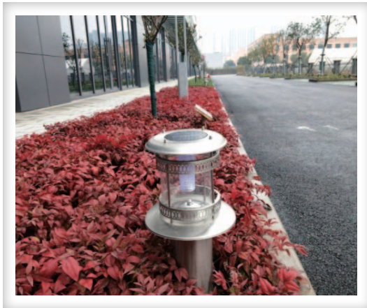
Solar Light installed in public area, which can make useful of natural energy for lighting. 公共區域採用太陽能燈，充份利用自然能源。

照明方面，工業園的廠房屋面設置了防紫外線的採光天窗，在春、夏、秋、冬四季均可充分利用自然光，一年可節省用電量約212.2兆瓦時。現時兩個工業園的室外照明主要為太陽能燈及LED燈，年節省電力約為107.3兆瓦時。常州工業園樓梯間和走廊照明採用紅外線感應開關控制，一年節省用電量約3.6兆瓦時。山東工業園，室內採用LED工礦燈，相比節能燈節約用電75%，且使用壽命是節能燈的12倍，一年可節省用電量約90兆瓦時。