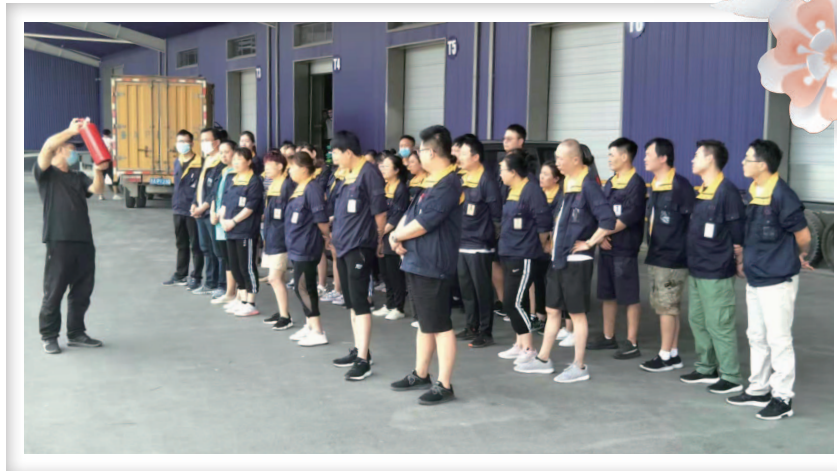
Fire Protection and Safety Training in 2020 2020年消防月安全知識培訓

公司定期組織全員消防疏散演練、消防安全知識倡導，在業務地點主要通道口張貼《火災疏散示意圖表》，建立應急準備及響應措施，使員工能冷靜應對緊急情況。