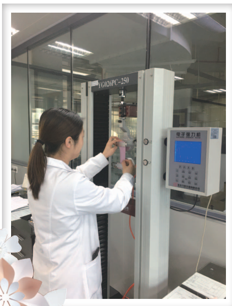
Testing lingerie by the technician 技術員對面料進行檢測

優質內衣面料的甲醛含量、pH 值等多項指標都必須得到嚴格控制。而從蕾絲花邊、棉杯、裡料到肩帶，都要求輕盈、柔軟、透氣、環保，具有良好的功能性，呵護女性健康。安莉芳內衣產品在出售之前，需要通過合共 30 多項嚴格的物料檢測。這些檢測包括環保性檢測、安全性檢測、舒適性檢測、功能性檢測及耐用性檢測等。